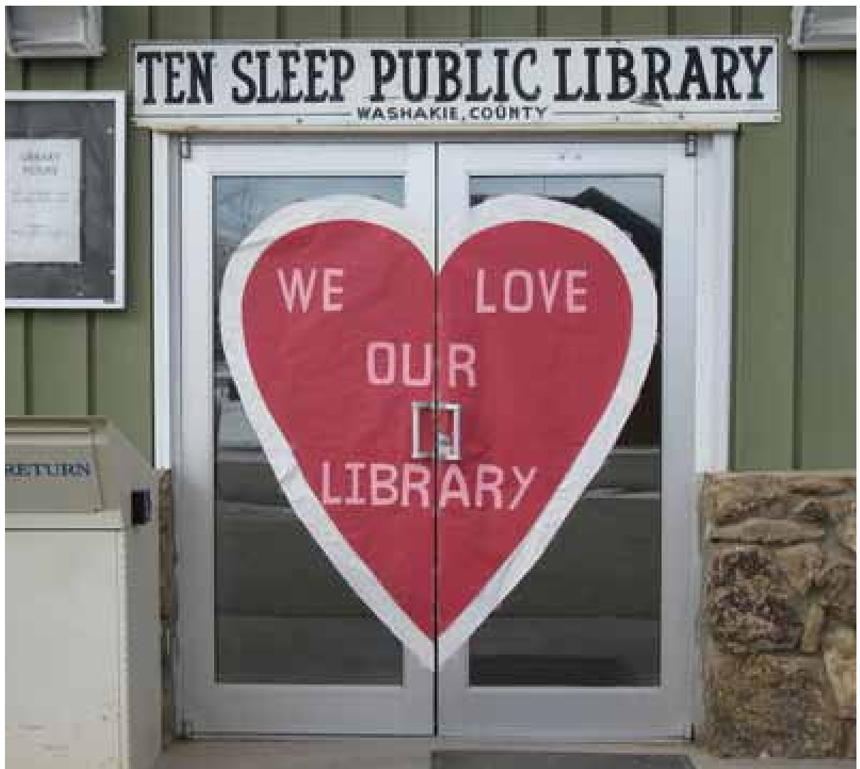
The residents of Ten Sleep, Wyo. uniquely expressed their affection for their local library on Valentine's Day with the handcrafted heart on the front door, shown above.